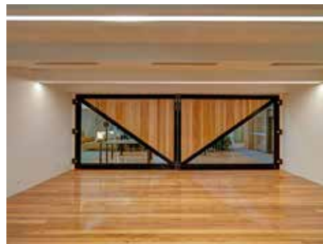
Multi-purpose Room A