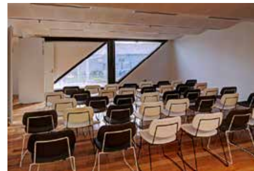
Multi-purpose Room B